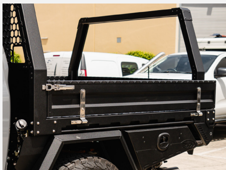
REMOVABLE TRAY SIDES

The most durable and flexible tray system on the market. M-Spec range is designed to be modular with a vast range of options and packages to suit the needs of your business. Every M-Spec tray integrates tie down rails, M12 nutserts for mounting and tie downs, removable tray sides & a sheetmetal headboard into a sleek yet capable package.