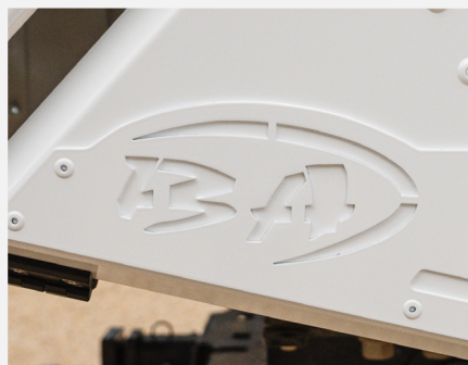
POWDERCOATED IN HOUSE