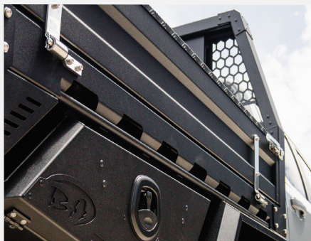
SLIM TIEDOWN RAILS