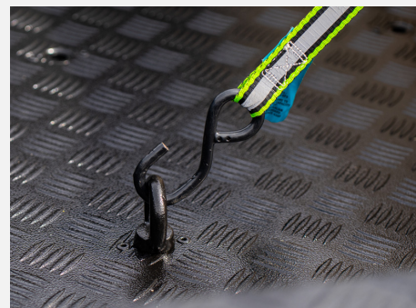
INTEGRATED M12 NUTSERTS