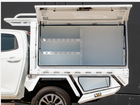
COMPATIBLE WITH M-SPEC TRAYS

Australian trades require flexible, secure storage solutions for their vehicles. Boss Aluminium toolboxes, available in over 30 variants, are adaptable to fit specific needs. From single boxes to a complete setup with roof rack, rear gate and central locking, these modular options seamlessly integrate with Boss M-Spec Trays.