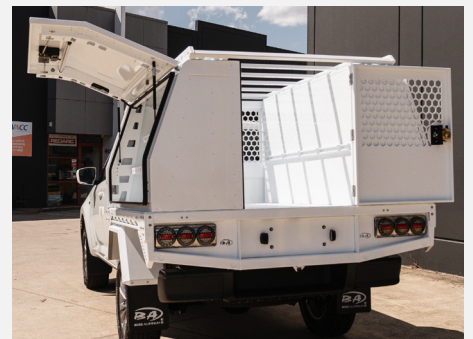
FLEXIBLE STORAGE OPTIONS