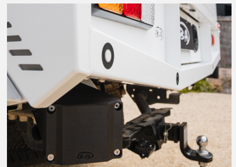
PARKING AND REVERSE SENSOR INTEGRATION